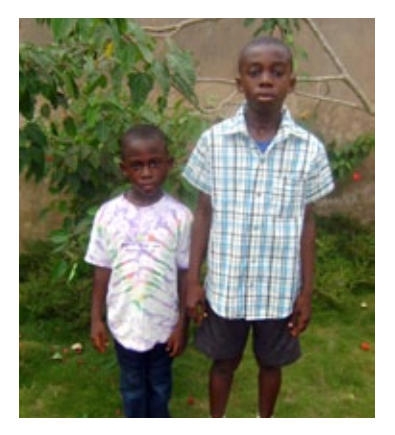
My little brother and me