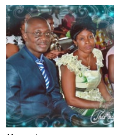
Some pictures showing my parents, my brother and myself!