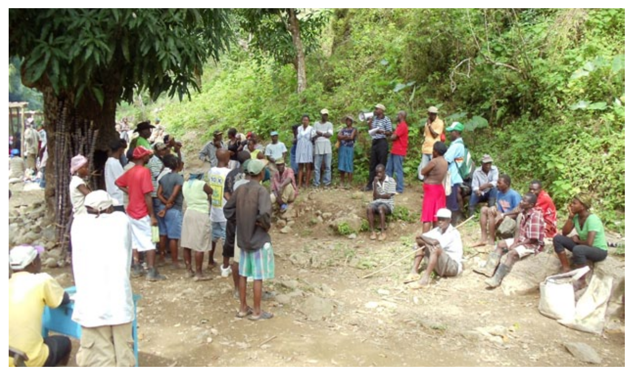
Family reunion at the source of the Ziguée river