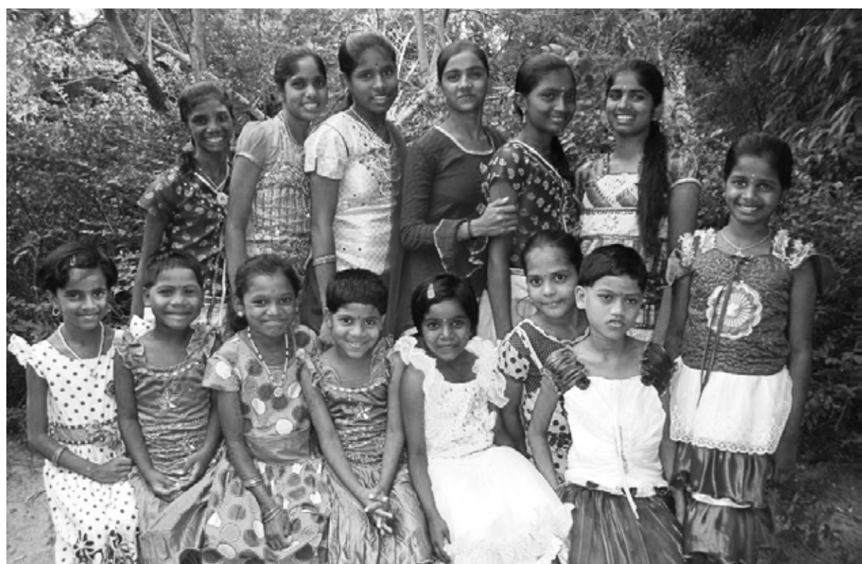
Young girls from Puspam