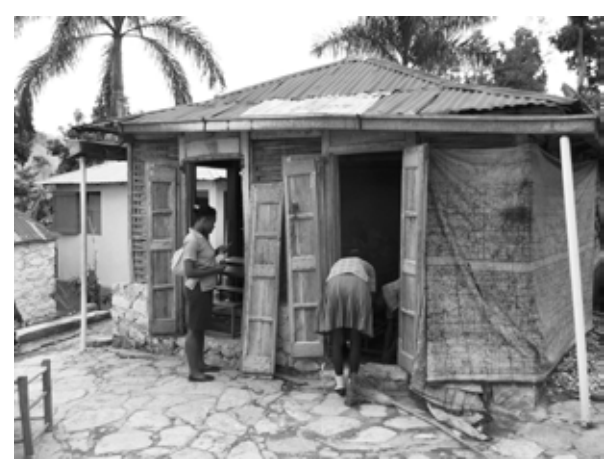
The Dumas school (current state).

an event. We are convinced that only the education can lead to a better equality of opportunities for the children and eventually end up in a true democracy.