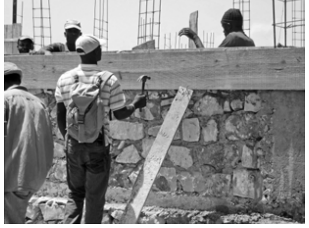
Ongoing construction at Dumas A rocks made 4 rooms building.

TDH ALSACE is also involved in a program targetting the hygiene improvement through to a better access to drinking water (see the issue 111, Nov. 2013, pages 12-13).