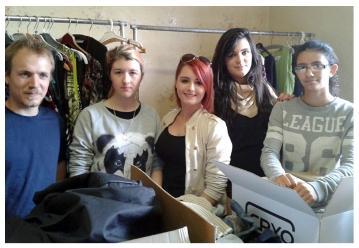
the collected clothes were delivered to our selling spot in Rixheim