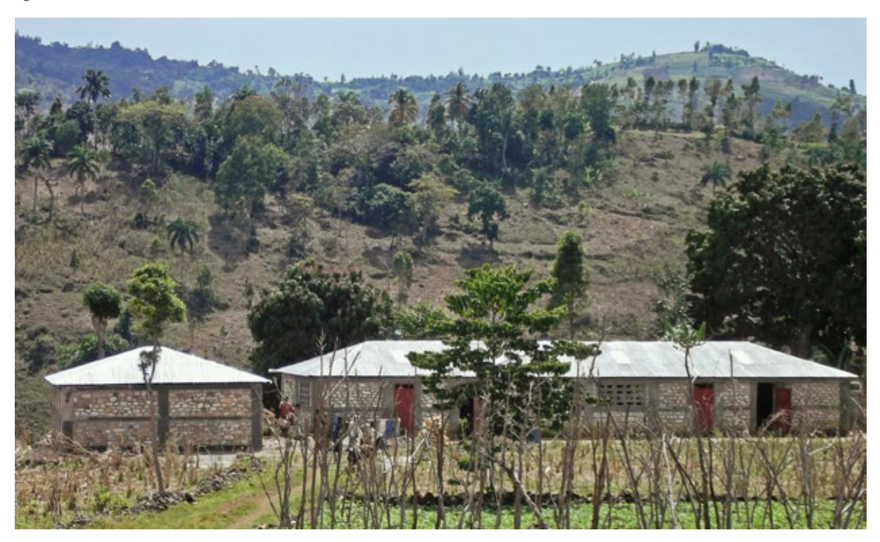
The Clermont school, which I visited end of 2014, was extended (see above on the left). The second building with three classrooms at Philo (picture in the 114 issue) was completed in February.

The schooling revival program on the areas of Palmes and Delatte in the region of Petit-Goâve started after the January 2010 earthquake. In this area of the Bellevue Mountains the program has turned out to be very challenging, all the more that this region was also badly affected by a strong aftershock.