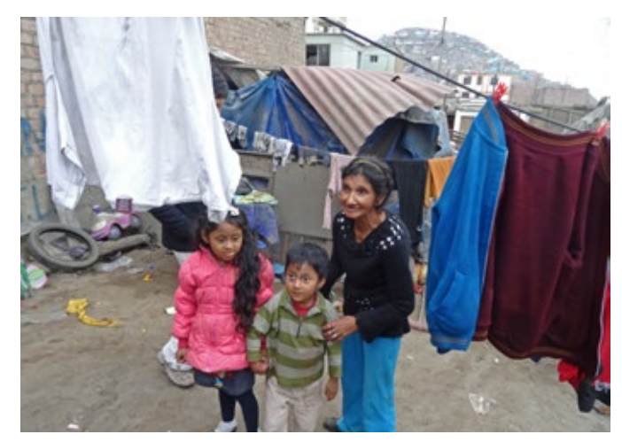
Réalité du bidonville

To manage such a structure is a challenging task. The revenues are coming from different charity organisations with Terre des Hommes at the forefront, donations from private individuals and proceeds from events (e.g. raffle) organized by the orphanage. The cash is tight with very little leeway for non-budgeted items. Quite recently they had to sell one pig (the orphanage breeds around 10 pigs) to cover the costs associated with the purchase of fire extinguishers in order to match the new safety regulation.