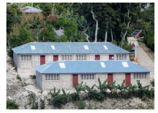
Since May the pupils of the Dumas centre can enjoy a second building with 4 classrooms