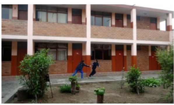
Réfectoire, dortoir et salle de cours d'un des groupe d'enfants

• The buildings hosting the Sisters, administration and