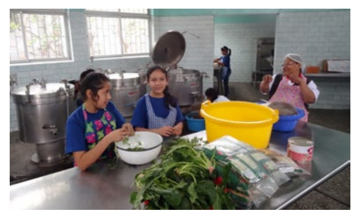
Préparation des repas à la cantine

The preparation of the meals is made by voluntary mothers. The demand is so high that Sister Ruth