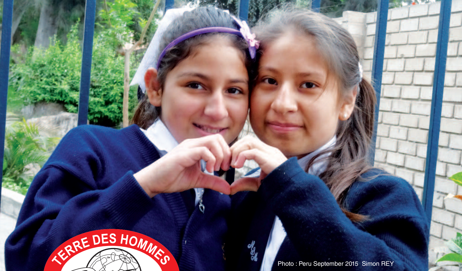
Photo : Peru September 2015