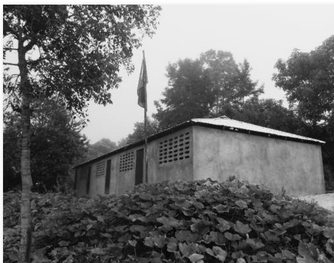
The new school in Lamielle built to satisfy anti-earthquake standards.