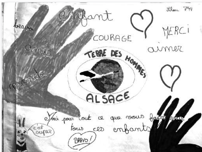
Lilou's drawing, moved by our action.