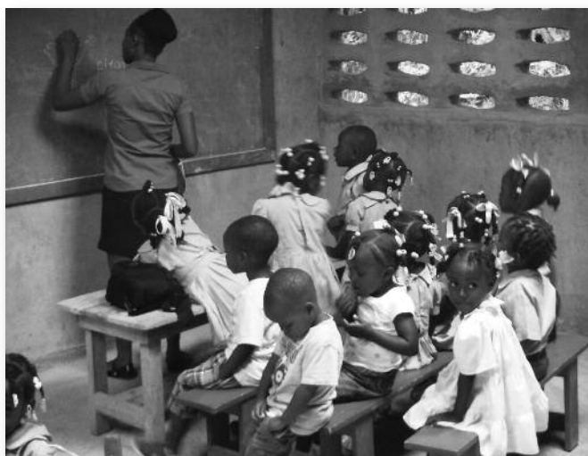
Classroom in the new school in Lamielle