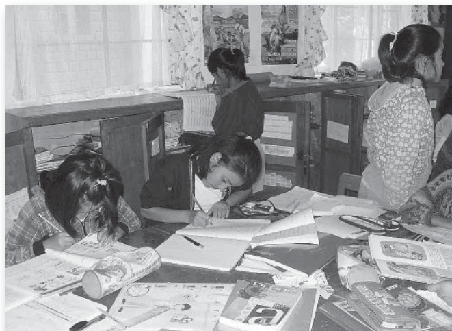
The homeworks of the teenagers