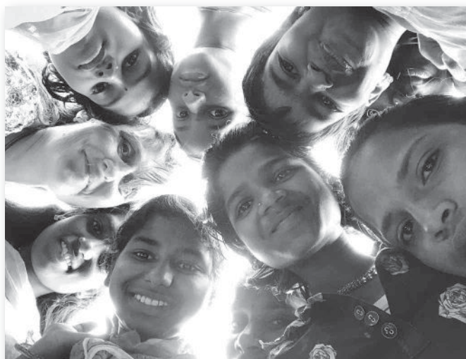
Young girls from the Kurinji home in June 2018. (except one 😊 !)