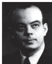
Antoine De Saint-Exupéry

(It is not a matter to foresee the future but to make it possible)