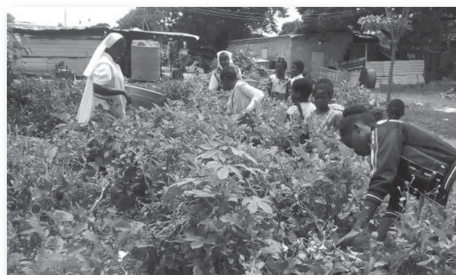
the harvest of beans, cabbage and other vegetables, and the preparation of cassava.