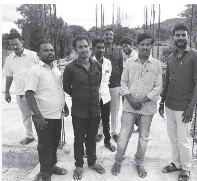
Part of the team of educational leaders.