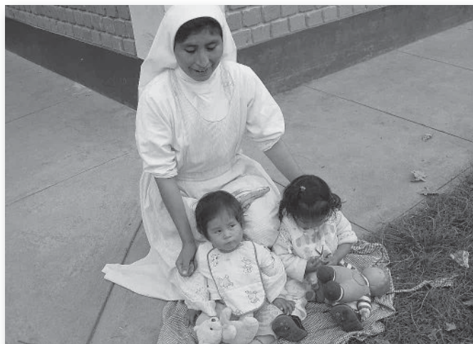
Games of the youngest