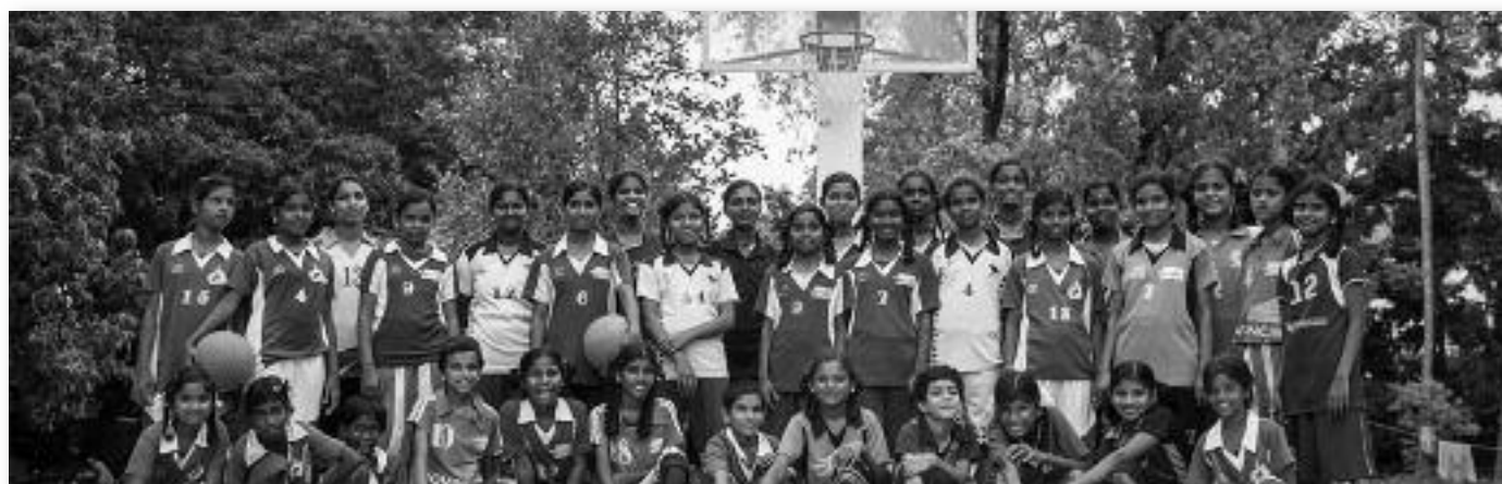
The Terre des hommes CORE girls team