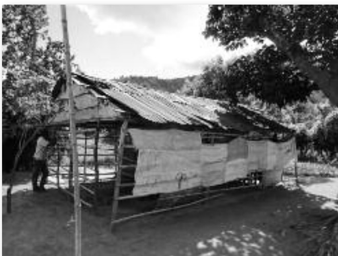
Mixed school - Laguna

The programme of school construction in Lamielle has also restarted after the sum break. Unfortunately, because the border with the Dominican Republic has been closed it has been difficult to get hold of the necessary building materials, but the recent re-opening should make it easy to obtain what is needed to continue the planned building work