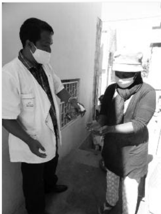
Hand disinfection with hydroalcoholic gel

On the medical side too, measures have been taken to allow the doctor to continue consultations three times a week. It was necessary to stock up on rapid tests and buy oximeters (devices that measure the oxygen concentration in the blood) but also to stock up on drug to anticipate a potential shortage.