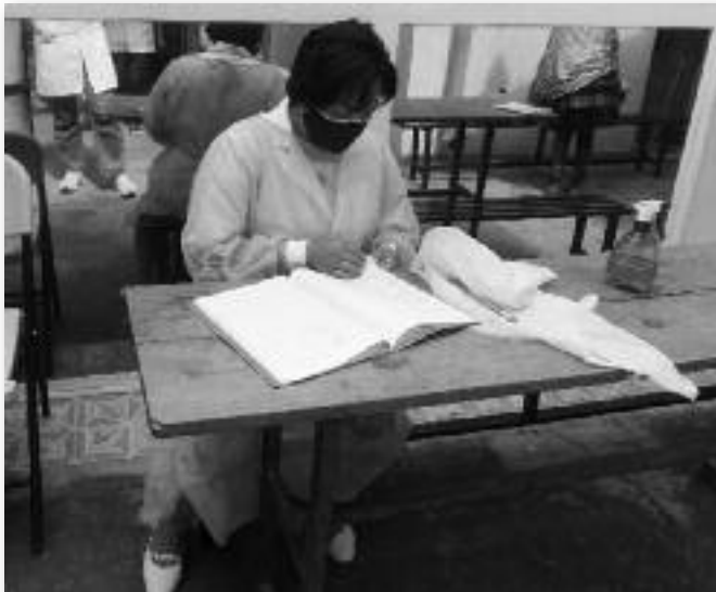
Reception while respecting barrier rules

Despite the restrictions, the centre's staff remained mobilized to help an increasingly vulnerable population. Reception while respecting barrier rules