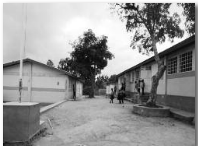
State school - Lamyel

The return to some sort of normality means more first-hand news from Lamielle can be expected in the coming months.