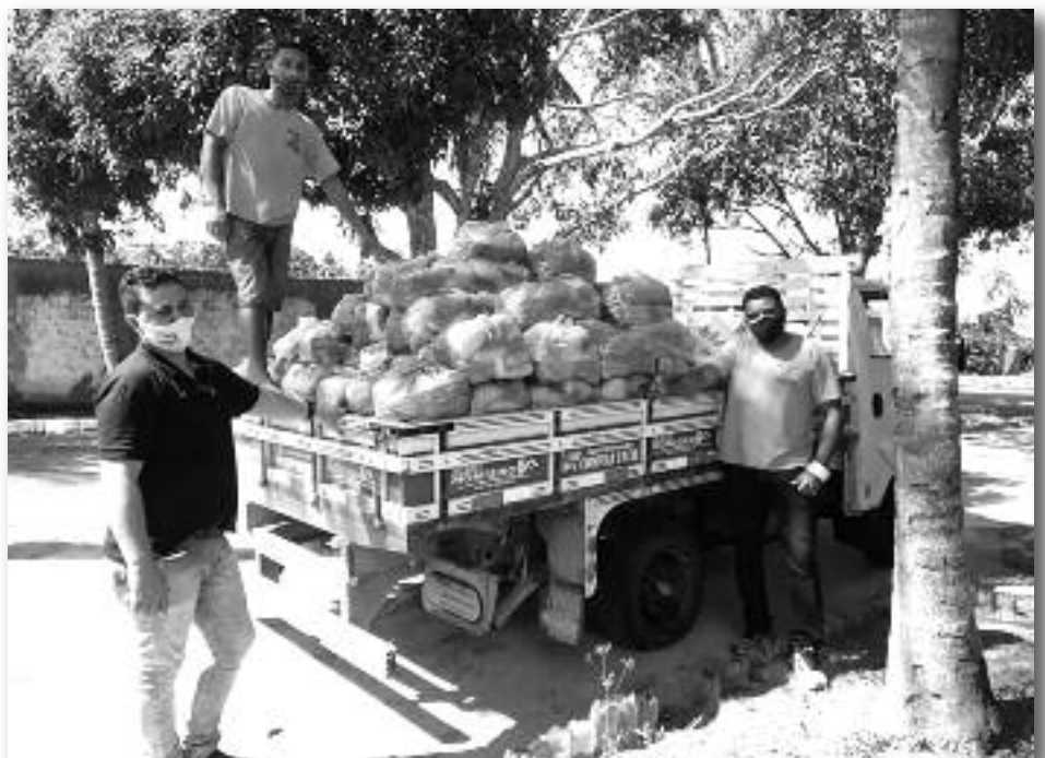
Delivery of foodstuffs

I would like to take this opportunity to thank Terre des Hommes Alsace, its volunteers and donors very warmly for being at our side during this difficult period. Take care of yourselves!