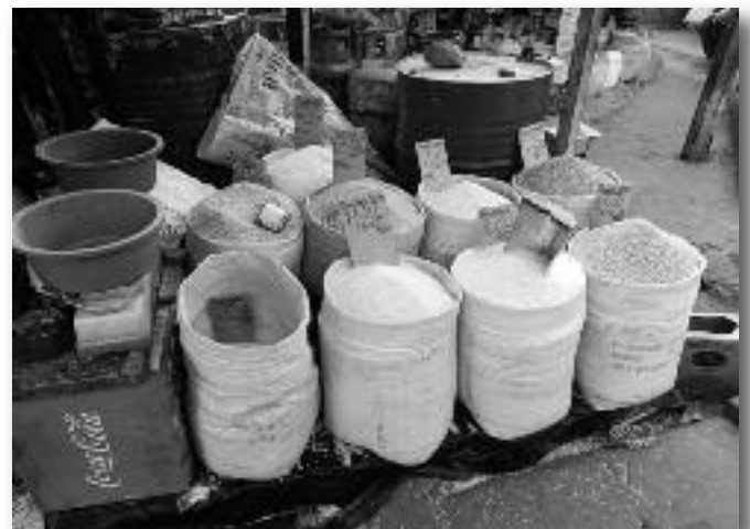
Rice is the staple food in Madagascar

In order to come to their aid, while still maintaining the necessary sanitary measures (disinfection of the premises, washing of hands and distribution of masks to the those in need), the ASERN team went looking for solutions. The realised the biggest difficulty was the lack of public transport which made it difficult for staff to come to work.