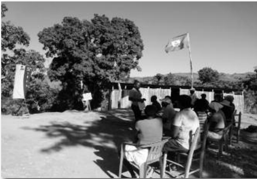
Raising education awareness - Melfile

Although the region was impacted less than the city of Port au Prince, where hospitals were forced to close their doors in certain cases as there was a lack of basic equipment to deal with the number of patients, the schools were closed. Fortunately, it was possible to put the time to good use with training for the teachers and a programme of outreach for the parents of the need for schooling for their children.