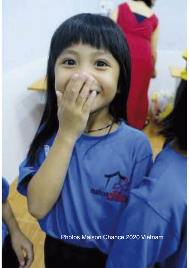
Photos Maison Chance 2020 Vietnam