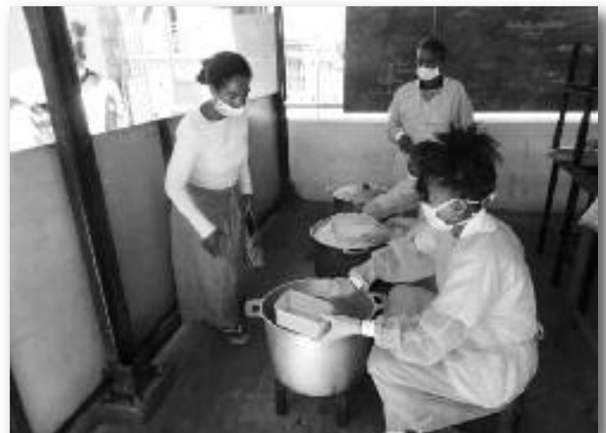
A mother collecting food for her children

Therefore, the team organized itself into two groups which each intervened three times a week to ensure the meals were distributed. Dry food (rice and dry pulses) rations were issued on a weekly basis.