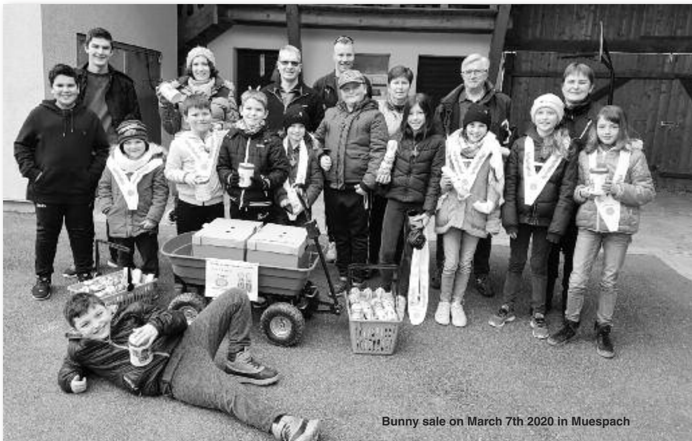
Bunny sale on March 7th 2020 in Muespach