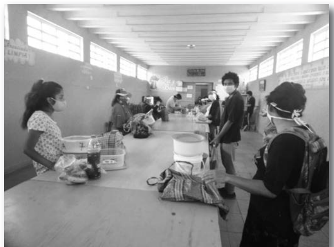
Preparation of food parcels by mothers