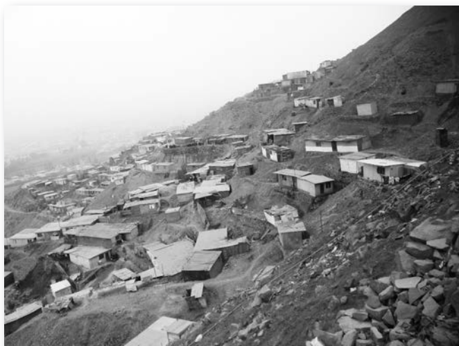
How to apply the lockdown in this type of building