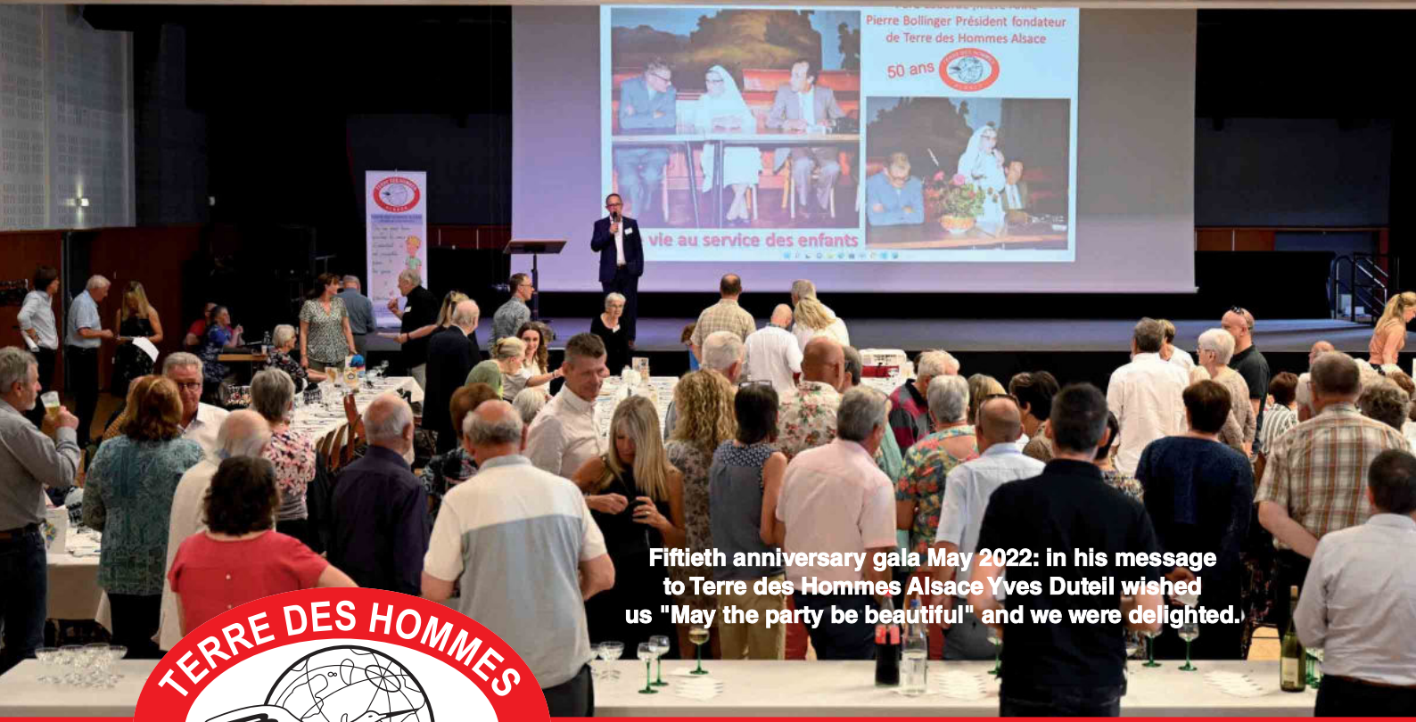
Fiftieth anniversary gala May 2022: in his message to Terre des Hommes Alsace Yves Duteil wished us "May the party be beautiful" and we were delighted.