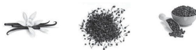
Vanilla and wild pepper from Madagascar and pepper from Brazil

The baskets are all unique and exist in three sizes, but above all this work allows a remuneration to women with the follow-up of the ASERN staff.