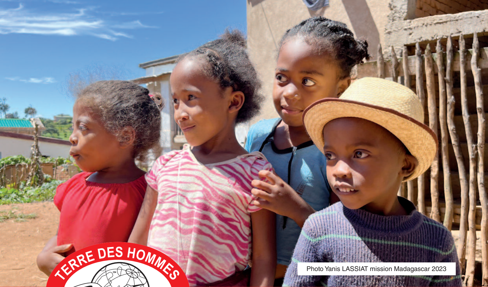
mission Madagascar 2023