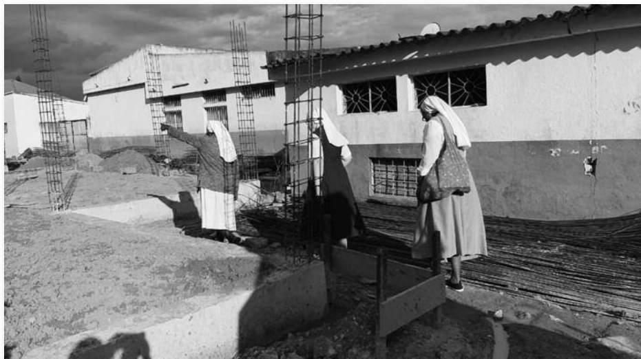
Photos of the construction site supervised by the sisters.