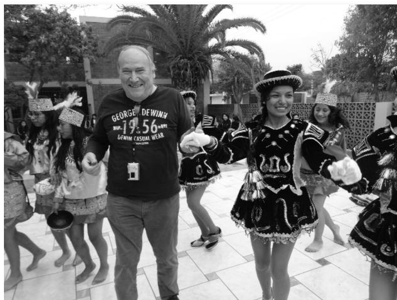
With the children of Puente Piedra in Lima