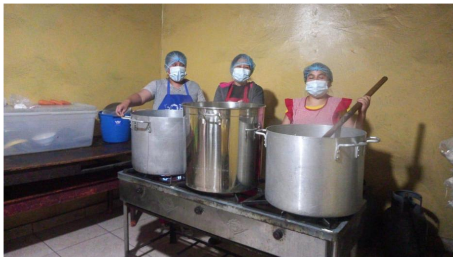
The cooks of one of the 4 canteens in Lima.