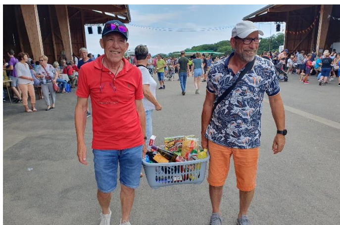
It's better to be strong to win in the youth raffle

Yes, our volunteers work without ever stopping. After an already very active start to the year, the pace was maintained with the solidarity breakfast and its 650 registrants at the Lindenhof farm, our exceptional partner, a large pastry stand for four days in Agrogast, before the 26th solidarity walk in Muespach-le-Haut with 432 walkers and more than 360 meals served in the dining room. The result of these three events allows the annual sponsorship of at least 120 children for a whole year (or more than 104,000 meals)! The youth group regularly participates in our events and offers great prizes in the raffle.