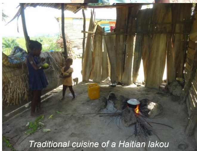
Traditional cuisine of a Haitian lakou

In the lakou of the Macajoux family there is a kay (the hut) made of woven wood and filled with earth. This house has two rather cramped bedrooms, which are mainly used for sleeping and storing laundry.