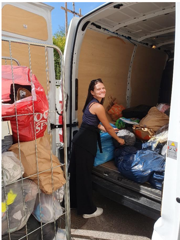
Participation in the clothing drive