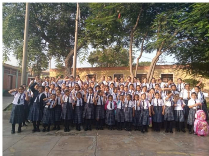
the children of Abancay on a walk.