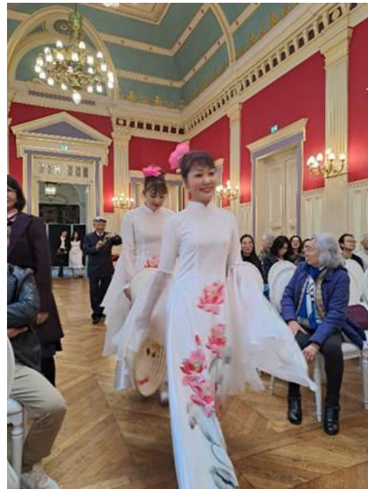
Demonstration of Vietnamese dances

In addition to traditional dance and music performances, several well-known singers from the Vietnamese community in Paris also performed during the afternoon.