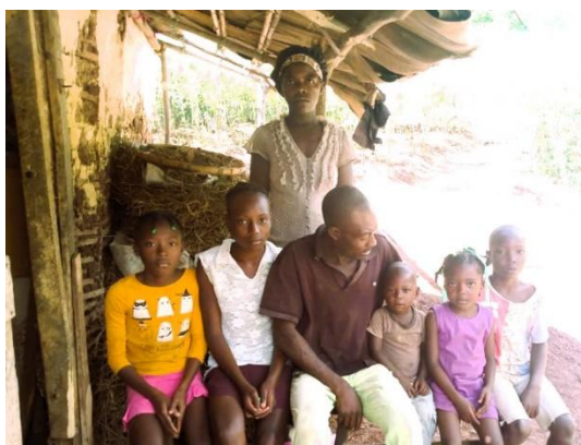
The Macajoux family in front of their house