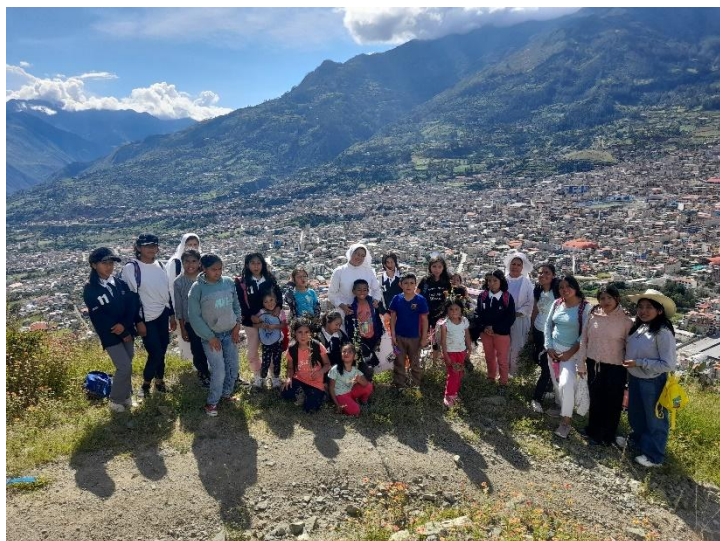
Les enfants de Puente Piedra.