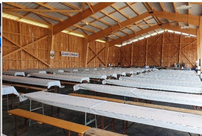
Beautiful shed of the Lindenhof farm – Hagenthal-le-Haut