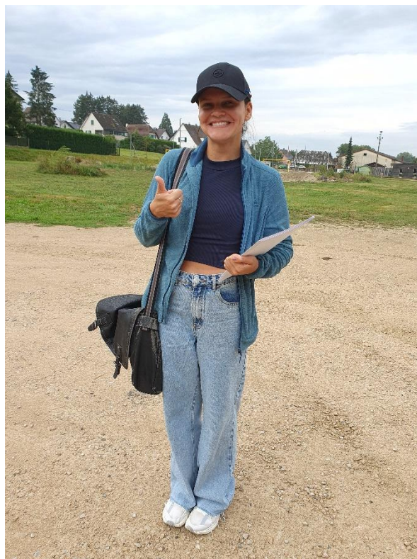
Distribution of leaflets for the solidarity march