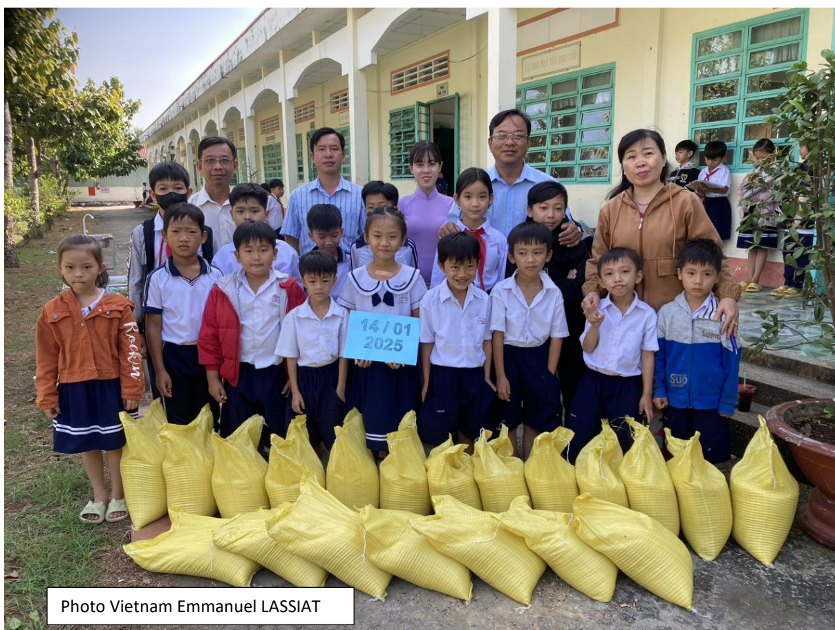
Photo Vietnam